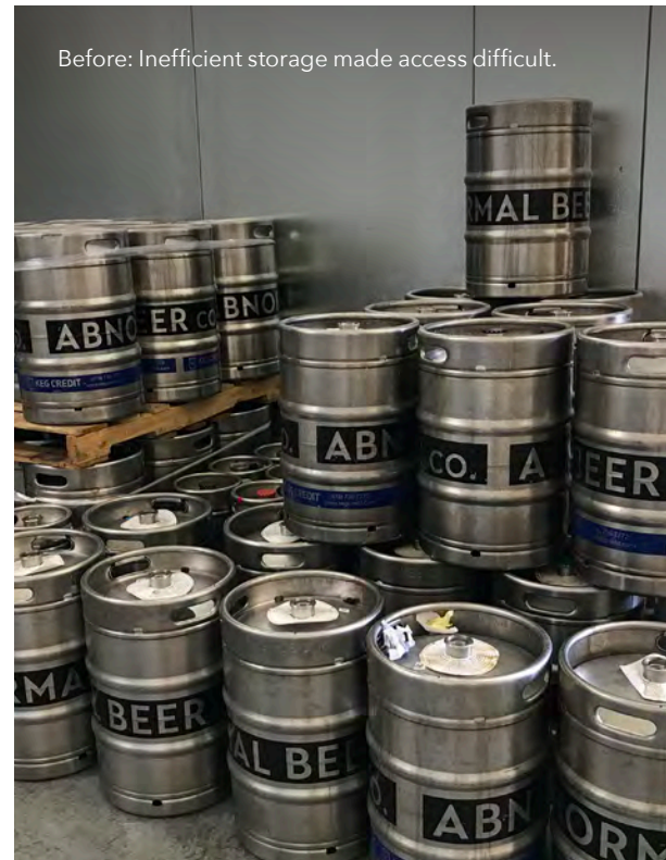
Before: Inefficient storage made access difficult.

Optimizing space in the cold box was a key aspect of the brewery's growth strategy.